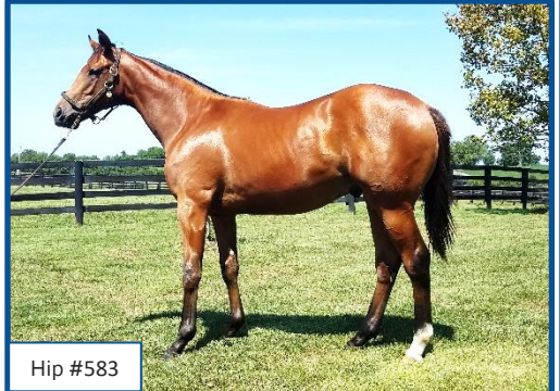
Into Mischief – Penrose Bay colt; Foaled: 4/8/18 Breeder: Cypress Bend Farm

As summertime winds down that means that it is time for sales season to begin in the Bluegrass! The autumn sale marathon kicks off with the Keeneland September Yearling Sale which runs from September 9-22. We have a small but high quality consignment this year, come out and see!