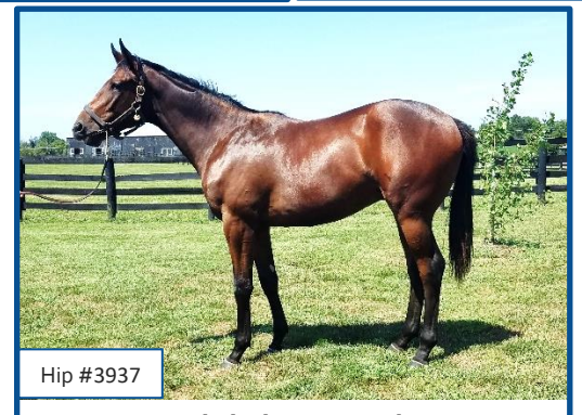
Upstart – Tightly Wound Bay colt; Foaled: 3/23/18 Breeder: Endeavor Farm