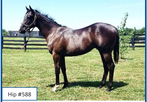
Honor Code – Poppy's Baby Girl Dk. bay/brown colt; Foaled: 5/14/18 Breeder: Endeavor Farm & Murray Stroud