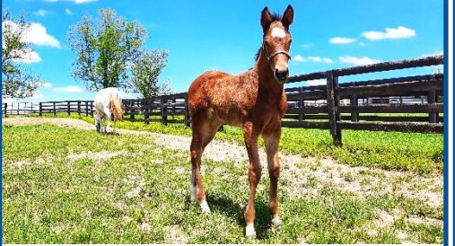
Goldencents – Roses Plus Bay filly; Foaled: 5/2/20 Breeder: Clyde Taylor