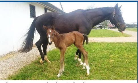
Flat Out – Little Stitch Bay colt; Foaled: 5/3/20 Breeder: Ronda Palmer & Joe Jennings