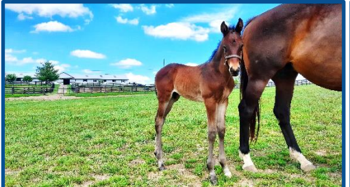
Mendelssohn – Poppy's Baby Girl Bay colt; Foaled: 5/15/20 Breeder: Endeavor Farm