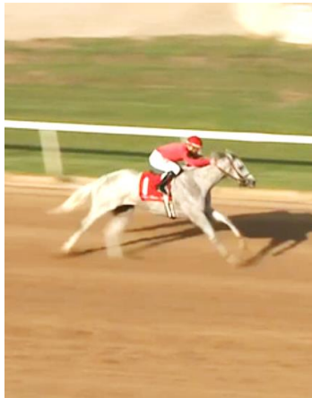
Derby Day Lassie