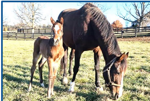
War of Will – Lisa’s Tale Bay filly; Foaled: 1/30/25 Breeder: Aithon Stable, LLC