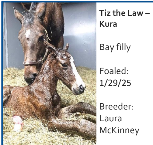
Tiz the Law – Kura