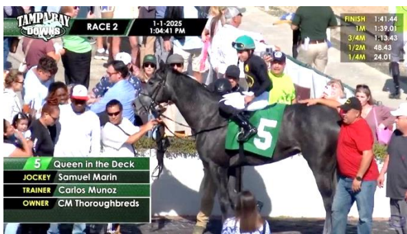
In the Winner's Circle at Tampa Bay Downs