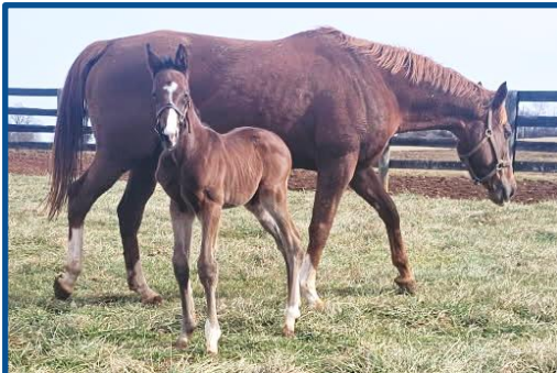
Loggins – My Heart Goes On Bay colt; Foaled: 1/23/25 Breeder: Coal Creek Farm