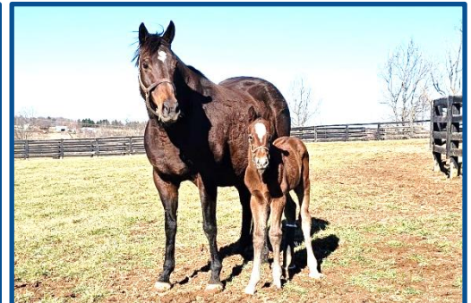
Frosted – Almada Gray/roan colt; Foaled: 1/30/25 Breeder: Lauri Seymour