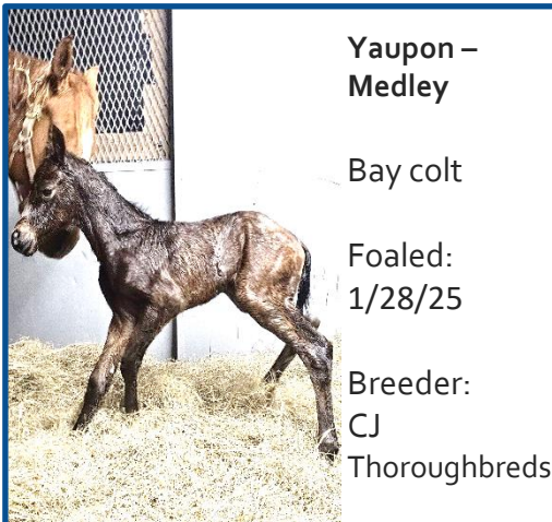
Yaupon – Medley