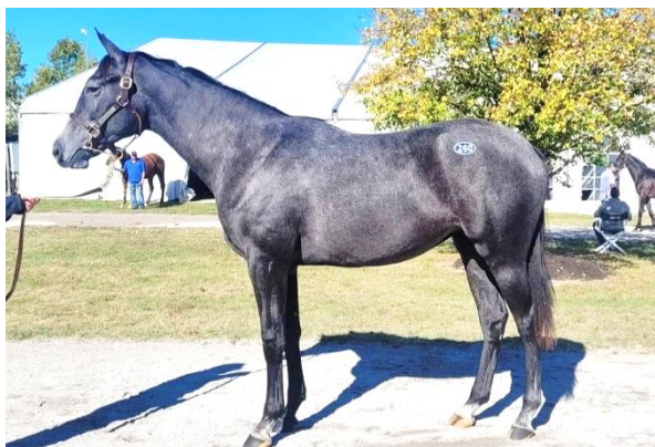
2023 Fasig-Tipton October Yearling Sale