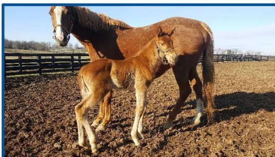
Langfuhr – Blondz Away Chestnut filly; Foaled: 1/20/17 Breeder: CJ Thoroughbreds

January is officially in the books now, which means that there are new arrivals running around and wreaking havoc all across the Bluegrass. We have been fortunate to have two happy and healthy babies here at the farm to get foaling season 2017 started off well. The first foal was a Langfuhr filly out of longtime resident Blondz Away, who is the dam of current stakes winner Colonel Samsen (featured in last month's newsletter). Two nights later we welcomed a bay colt by Revolutionary out of Myturtlecreekbabe. He is the first foal for his dam, who was also born and raised here and happened to be foaled in the same stall her foal was born in five years ago. This time of year is always so exciting for us and we wish everybody the best of luck with their expecting mothers this year. Congratulations to the breeders and owners of these beautiful animals.