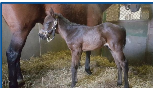
Revolutionary – Myturtlecreekbabe Bay colt; Foaled: 1/22/17 Breeder: Barnett Eques