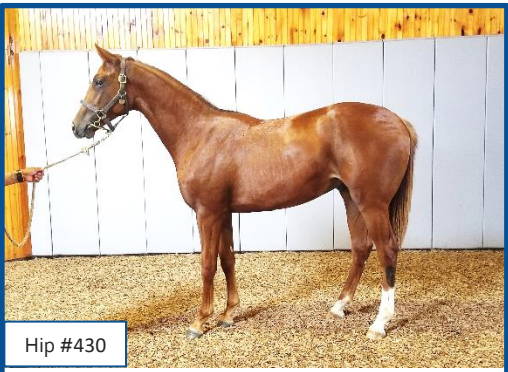
Will Take Charge – Fast Laner Chestnut colt; Foaled: 4/18/18 Breeder: Cypress Bend Farm