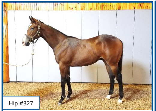
Outwork - Denotation Bay colt; Foaled: 5/10/18 Breeder: Caveman Stables

With Keeneland September in the books it's time to move right on to the next one! The Fasig-Tipton October Yearling Sale is up next on the calendar, which has become a very strong sale in recent years. Three colts once again make up our consignment for this sale, we hope you stop by and see them!