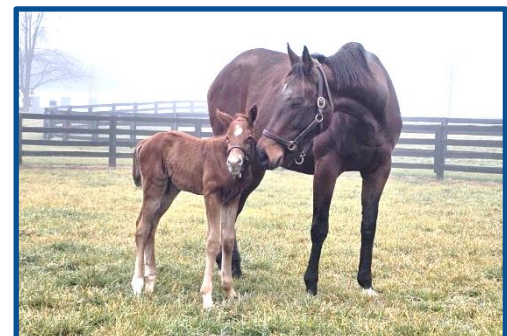
No Parole – Strange Design Chestnut colt; Foaled: 1/23/24 Breeder: Dream Big Racing, LLC