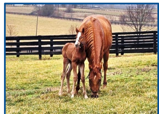
Jack Christopher – Honest Outlaw Chestnut filly; Foaled: 1/23/24 Breeder: Wolverton Mountain Farm